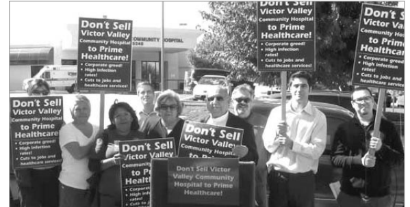
Community leaders in the High Desert came together to expose Prime and oppose purchase of their bankrupt hospital in November 2010.

From Redding to Riverside, Prime has engaged in aggressive tactics to take over ailing community hospitals, from acquiring hospitals' debts to gain leverage in bankruptcy proceedings to engaging in backroom negotiations to position itself as a purchaser. Communities are beginning to take note and mount opposition to Prime takeovers. In November 2010, Prime attempted to purchase bankrupt Victor Valley Community Hospital in Victorville. In a San Bernardino Sun op-ed, community leaders wrote, "We believe that concerns about Prime Healthcare's practices are too serious to allow the company to purchase Victor Valley Community Hospital without scrutiny and under circumstances that have not been put to a public debate." Prime's bid to take over the hospital was rejected by the board.